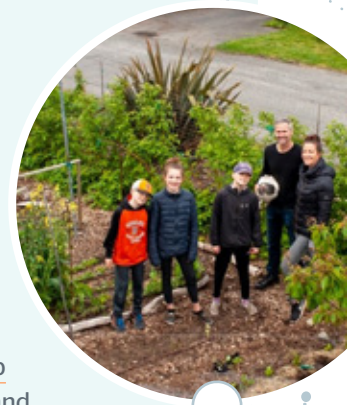
Vancouver Island residents turn their front yards into food gardens amid COVID-19.

Start volunteering, e.g., Fraser Valley Gleaners Society , a faith-based organization reducing food waste by working with volunteers, collecting produce and processing it for distribution to developing countries.