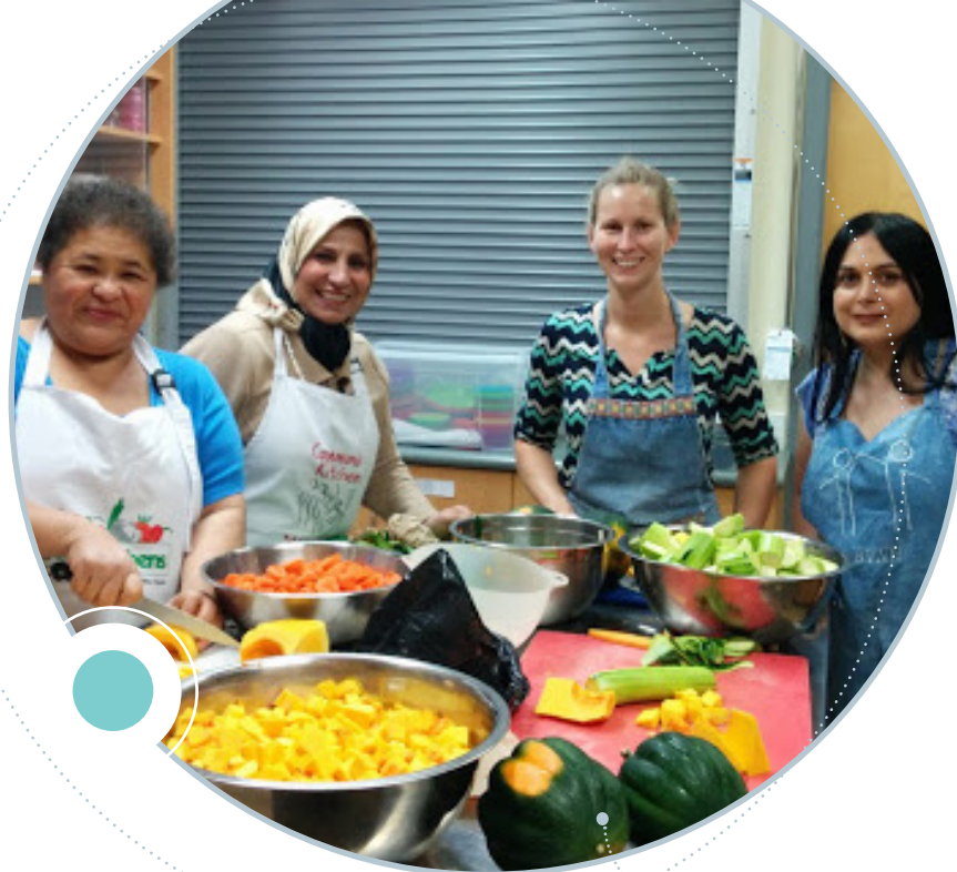
Members of the South Vancouver Food Network (SVFN) prepare a meal.

Creating connection and a deep sense of community is a key part of impactful change towards lighter living and equitable wellbeing for all.