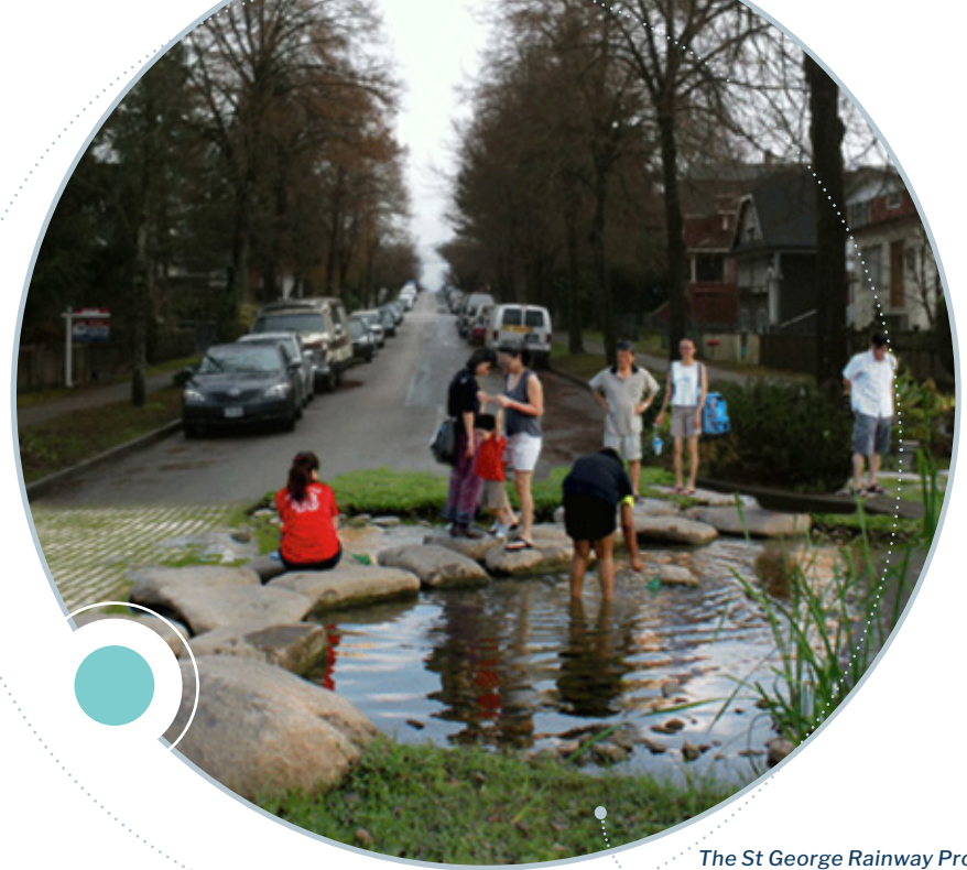
The St George Rainway Project, a community driven initiative that seeks to surface a historic waterway in Mt. Pleasant.

Please let us know if you're taking on the Super Challenge! Email us at info@oneearthweb.org