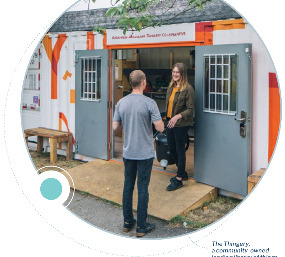
The Thingery, a community-owned lending library of things.