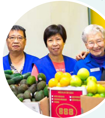
Richmond Food Recovery Network.