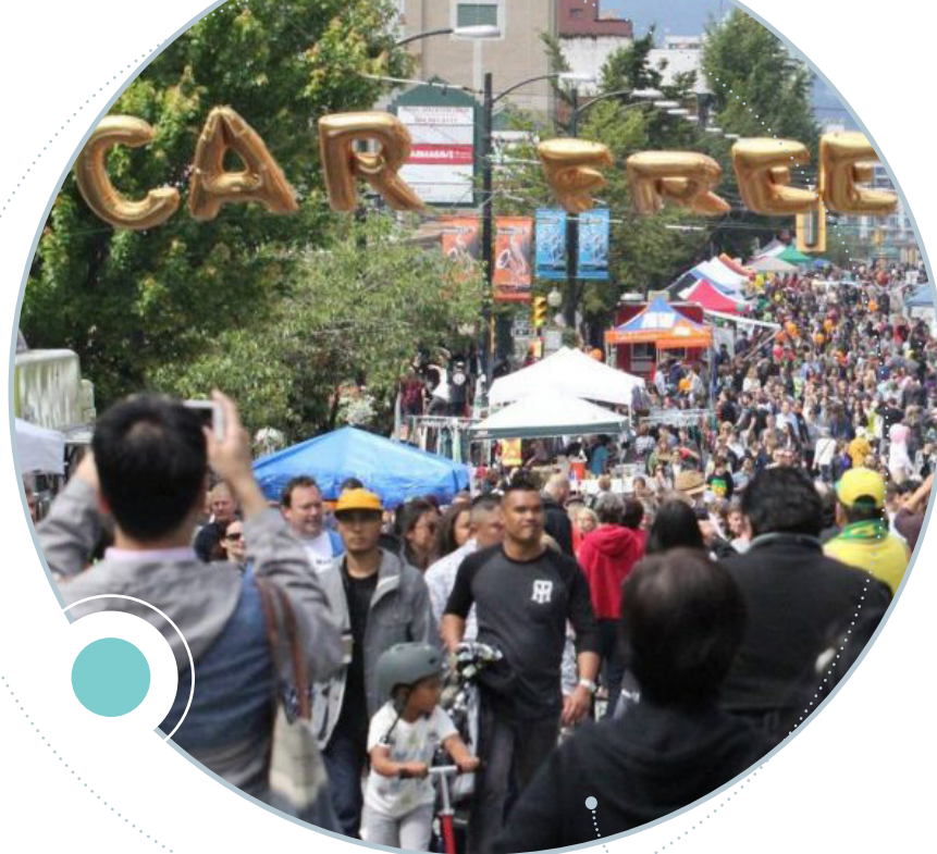
Car Free Day 2016: Main Street from Broadway to 30th Avenue, Vancouver.

There are 100s of block parties every year in Metro Vancouver — and more across BC. You can apply for a $500 Neighbourhood Small Grant to support a local project: neighbourhoodsmallgrants.ca