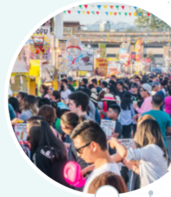
Richmond Night Market

For help with waste management , you can work with groups like the Binnars Project (waste-pickers) to hire folks to monitor disposal stations and make sure items are sorted correctly.