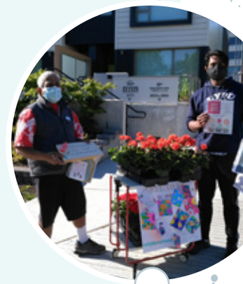
Welcoming new neighbours for Mother's Day at Riverside Gardens.

Explore great resources from Green Bloc , a project that brought together neighbours to find innovative and creative ways to reduce ecological footprints, from their households to their "bloc."