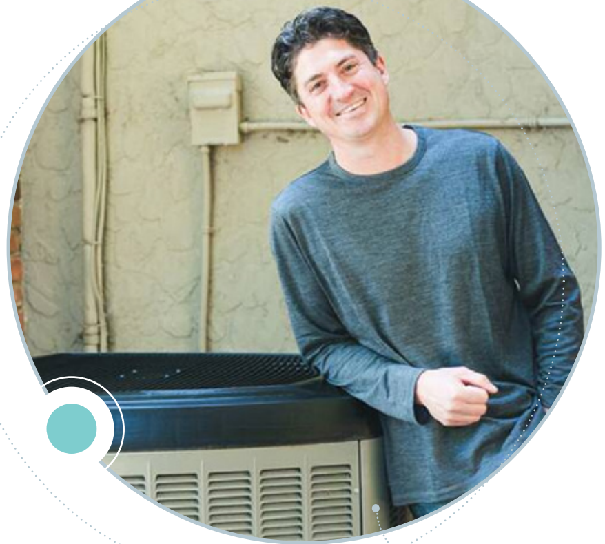
Installing a heat pump can lead to big wins for the climate.