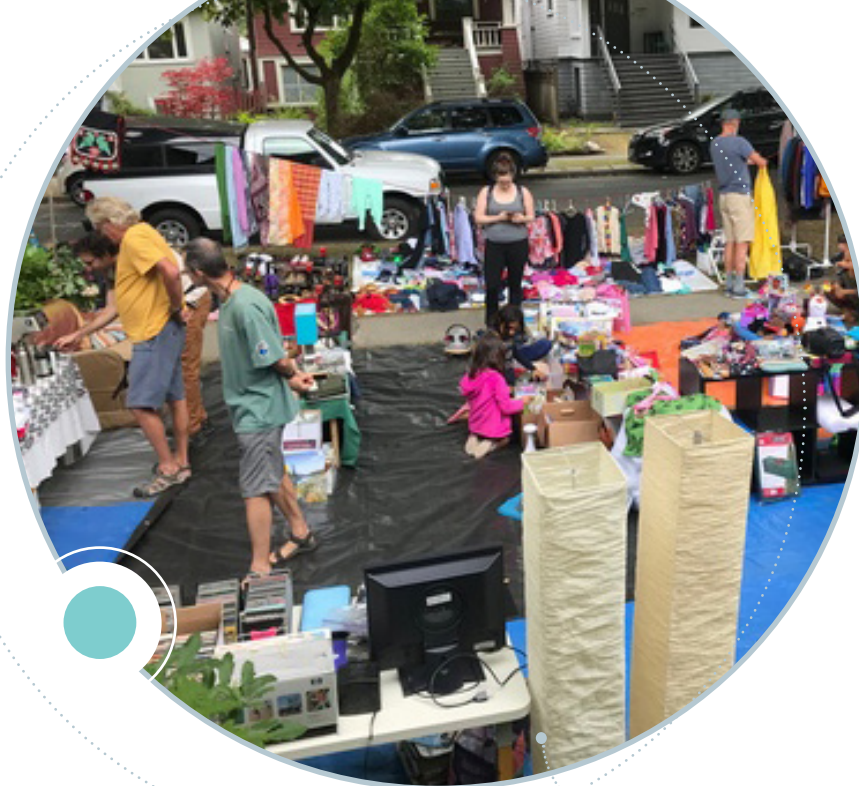
Amma Vancouver Annual Garage Sale.