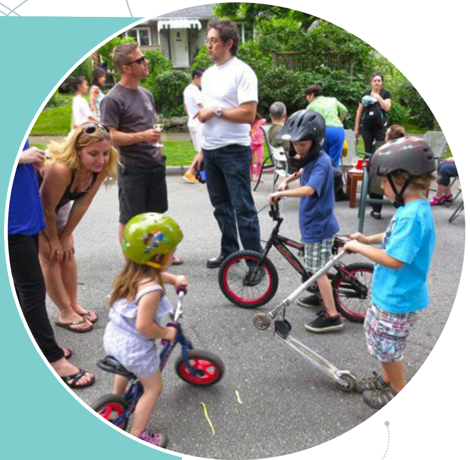
Kitsilano Neighbourhood Block Party on Car Free Day Vancouver Weekend, 2019.

The Neighbourhood Small Grants team assisted organizers in applying for permits from the City of Vancouver, coordinating street barricades, featuring the local business improvement association (BIA) in gift baskets, and creating a space that encouraged connection and community.