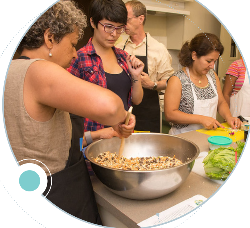
West End cooking workshop

— RESIDENTIAL FOOD WASTE PREVENTION TOOLKIT, BC MINISTRY OF ENVIRONMENT