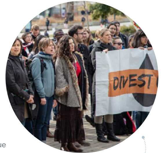
UBC Climate Strike, 2019

Ultimately, lighter living is about living better lives — with a focus on respecting our planet and each other and prioritizing more of what matters, not just more stuff or harmful consumption. Let's build what matters—including health, security, belonging, trust and joy.