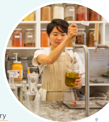
Refillable products.

Zero waste campaigns like Trash Is For Tossers and My Plastic-Free Life promote engagement with low-waste lifestyles, while strategies like the City of Vancouver's Single-Use Item Reduction Strategy provide government support for minimizing waste.