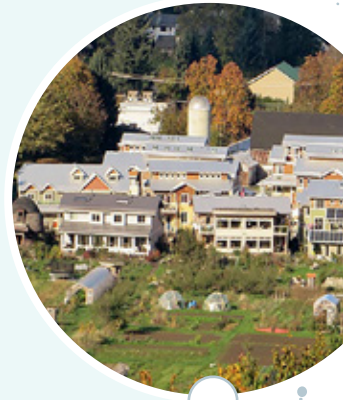
Groundswell Cohousing at the Yarrow Ecovillage.

E-bikes for cargo transportation started as a pilot in Vancouver in May 2021 to reduce traffic congestion and air pollution from trucks. The pilot will have e-bikes transporting cargo from micro hubs to their final destinations.